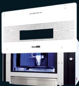
NEW! MILLING UNIT M4