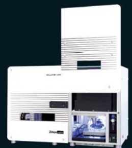
NEW! MILLING UNIT M6