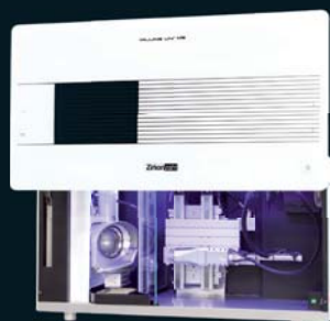
MILLING UNIT M5 HEAVY