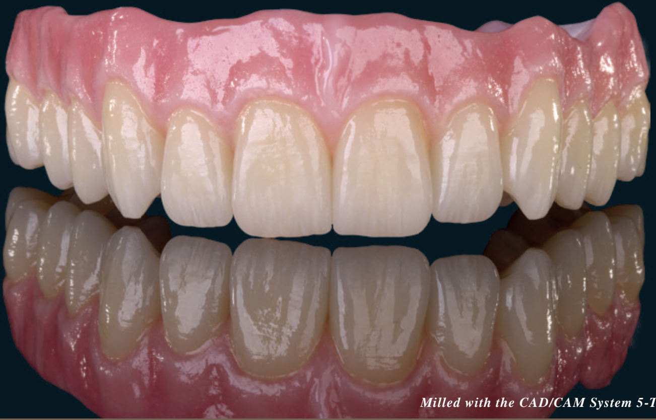
Milled with the CAD/CAM System 5-TEC