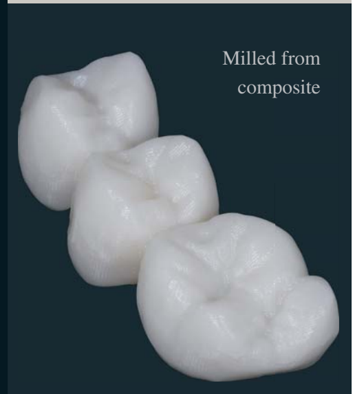
Milled from composite